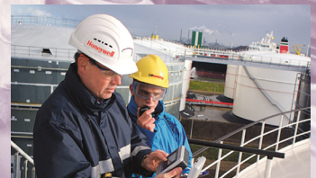
RAIL & FIELD ASSETS