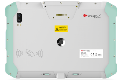
backside of the SD100