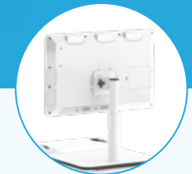
Monitor post with height, swivel + tilt adjustment