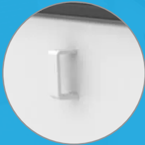
Secure your drugs cart to the wall

Associate Dean & School of Nursing Patient Safety Lead Staffordshire University