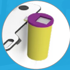
Dispose of your sharps waste safely