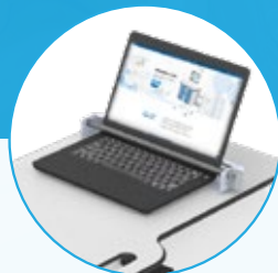
Secure worktop laptop bracket