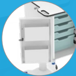
Upright bottle storage