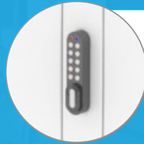
Digital code lock

"Every time a nurse is looking for keys, that's a patient who is ultimately not getting the care they need."