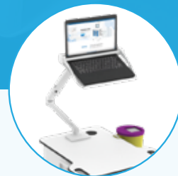
Ergonomic arm + secure laptop bracket