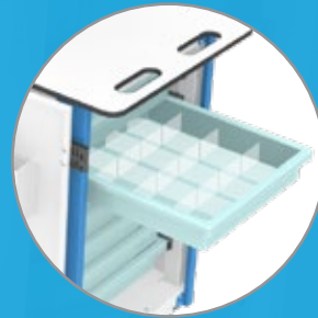
Drawer dividers for organising medication