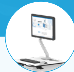
Ergonomic monitor arm