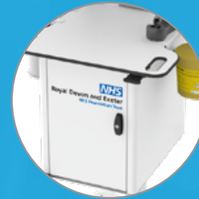
Make it your own with your trust's branding printed directly onto the cart