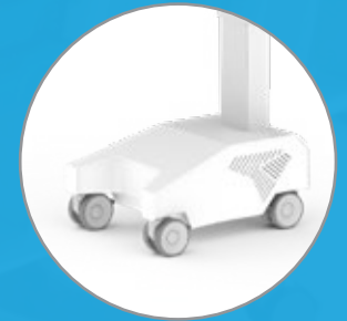
PowerLiFe battery for 8 hrs continuous use

We are able to integrate a wide range of laptops, monitors and all-in-one medical grade computers.