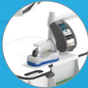
Scan wristbands, print & label samples from one workstation