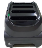
4 slot Battery Charger