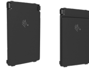
Batteries (3300 mAh, 5260 mAh)