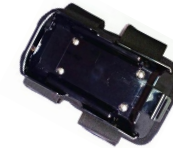
Wearable Arm Mount