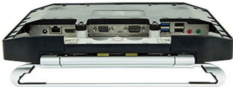
Compatible with R12 SlateMate module