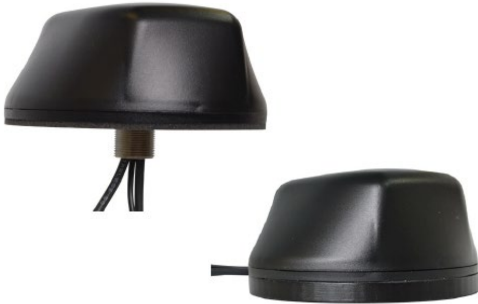
Mag-Mount Option (Magnetic)