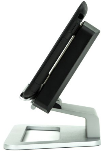
Fully-adjustable viewing angle