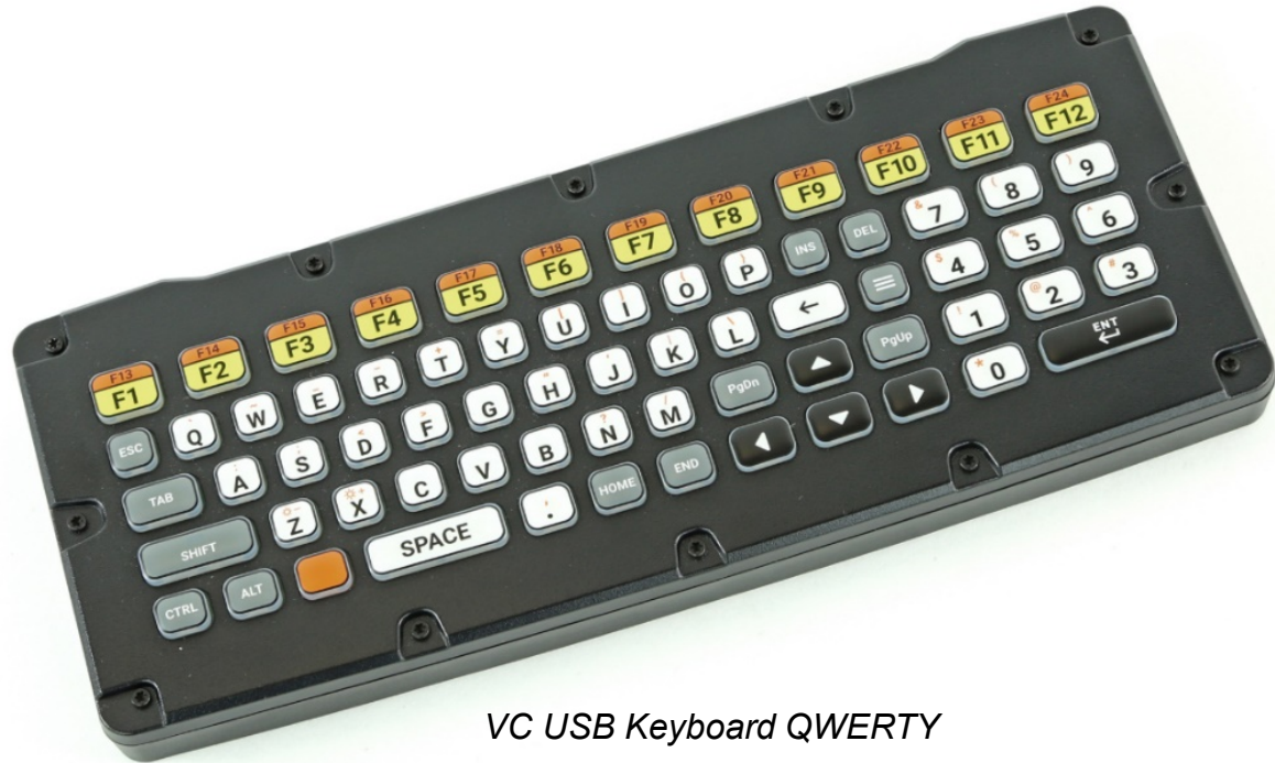
VC USB Keyboard QWERTY