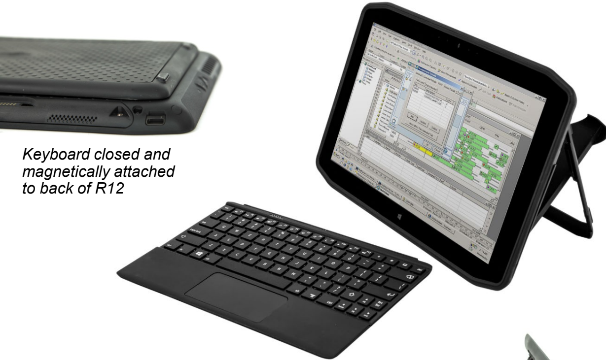
Keyboard closed and magnetically attached to back of R12