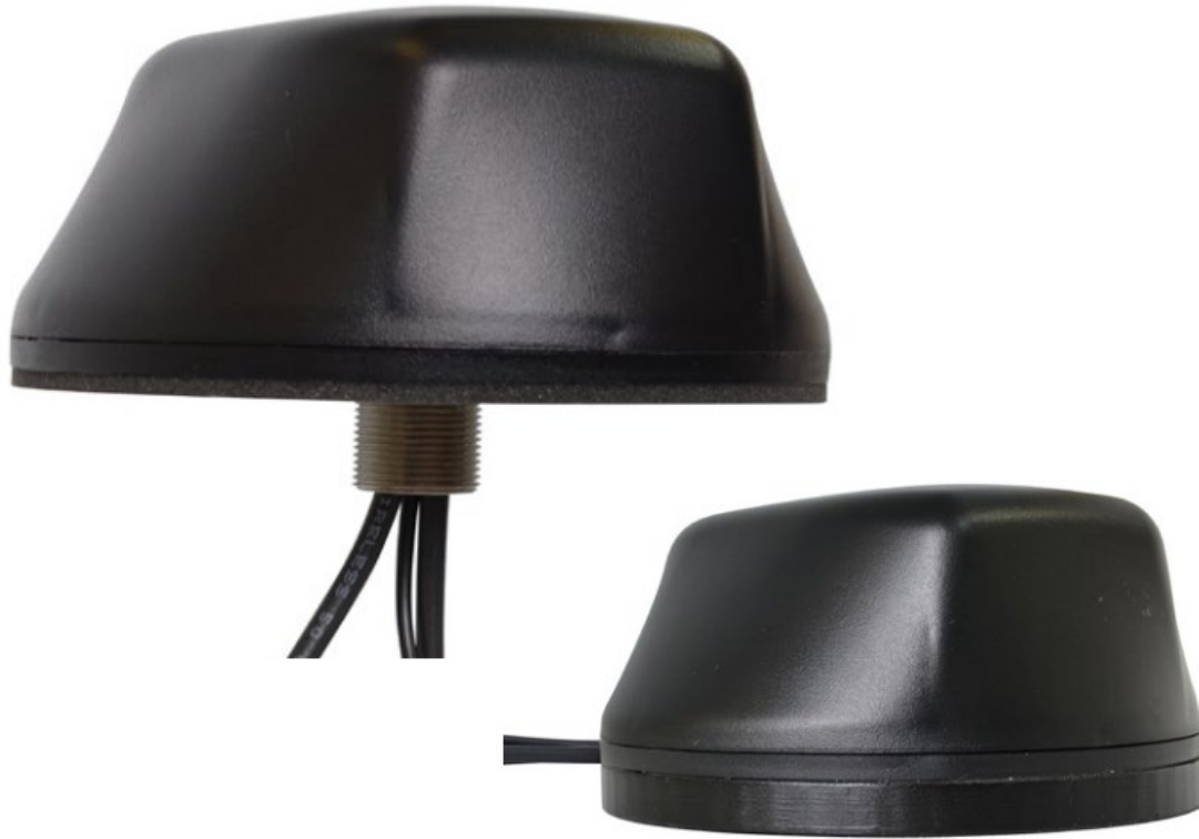
Mag-Mount Option (Magnetic)