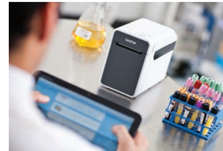
Increased freedom and mobility - print wirelessly from virtually any tablet or handheld device

The Mobile Software Development Kits (SDK) makes it easy for developers to incorporate label and receipt printing into mobile apps. There are SDKs available for iOS™, Android™ and Windows Mobile™.