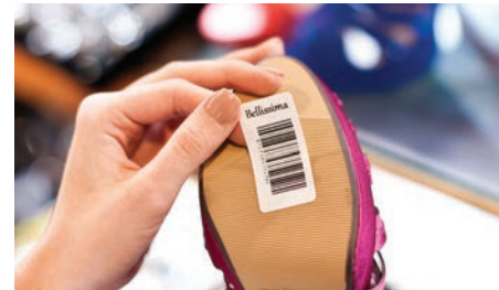
Many different types of labels can be printed with the TD-2000 series

Brother RD labels also contain no Bisphenol-A, a common chemical used in the manufacture of inferior labels. As such, Brother RD labels are safe to use in the food industry, and also pose no hazard to the health of infants and young children.