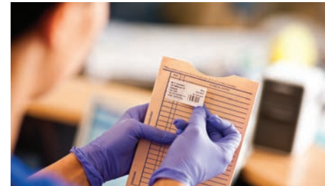
Locate patients' records and other important documentation quickly with an identification label