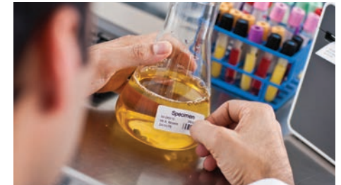
Ensure that patients' samples are clearly and correctly identified