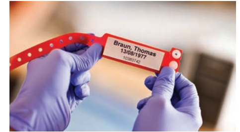
Print basic patient details when required