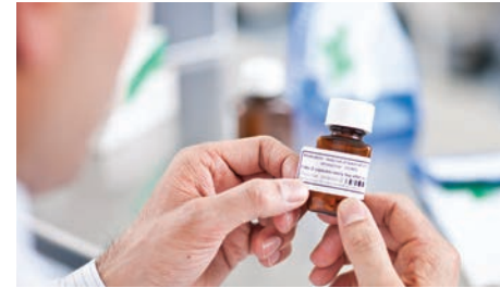
Label sizes can be adjusted to fit different sized tablet containers