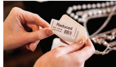
Push through slow moving stock by creating sales labels whilst on the move in store