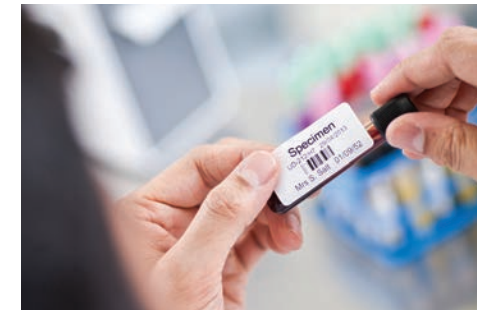
Simply apply your custom designed label