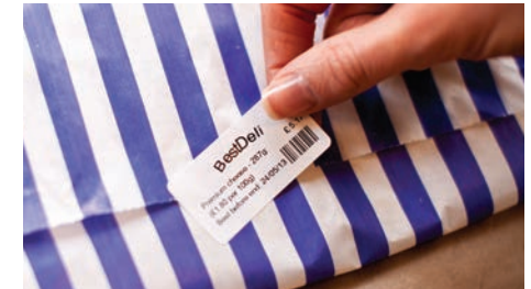
The adhesive used in Brother RD rolls has been certified safe for food labelling