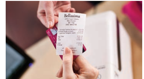
Provide your customers with clear/concise sales receipts