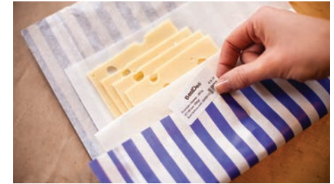
Ensure the safety of your customers with clear 'Use By' labels