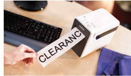
The continuous roll offers the ability to create larger signage on demand

Increase productivity & efficiency by enabling busy retail workers to print a wide range of labels on the shop floor by incorporating TD-2000 with a trolley/mobile workstation. With its compact design, the TD-2000 is also ideal to use on crowded retail desktops and counters without sacrificing valuable workspace for a standard sized desktop printer. Sharp text, logos and barcodes printed quickly on high quality Brother media can help contribute to enhanced customer satisfaction at the counter or check out.