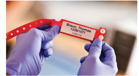
Print basic patient details when required