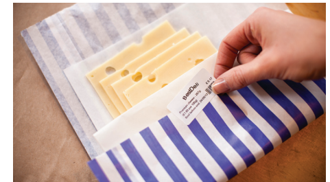
Ensure the safety of your customers with clear 'Use By' labels