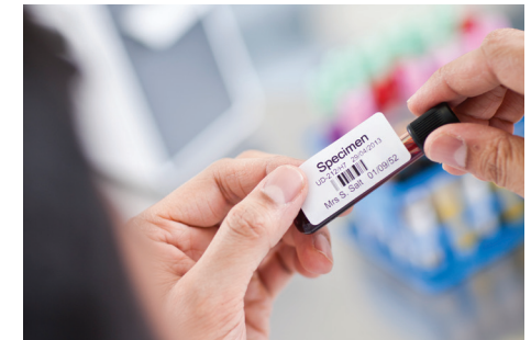
Simply apply your custom designed label