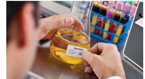
Ensure that patients' samples are clearly and correctly identified