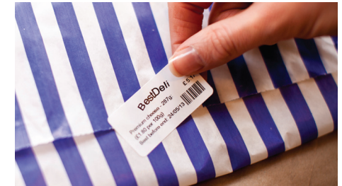
The adhesive used in Brother RD rolls has been certified safe for food labelling