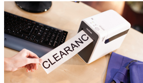
The continuous roll offers the ability to create larger signage on demand

Increase productivity & efficiency by enabling busy retail workers to print a wide range of labels on the shop floor by incorporating TD-2000 with a trolley/mobile workstation. With its compact design, the TD-2000 is also ideal to use on crowded retail desktops and counters without sacrificing valuable workspace for a standard sized desktop printer. Sharp text, logos and barcodes printed quickly on high quality Brother media can help contribute to enhanced customer satisfaction at the counter or check out.