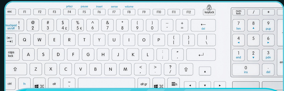
GLASS KEYBOARD CLEANKEYS®