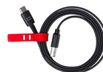
TYPE A/TYPE C USB CABLE