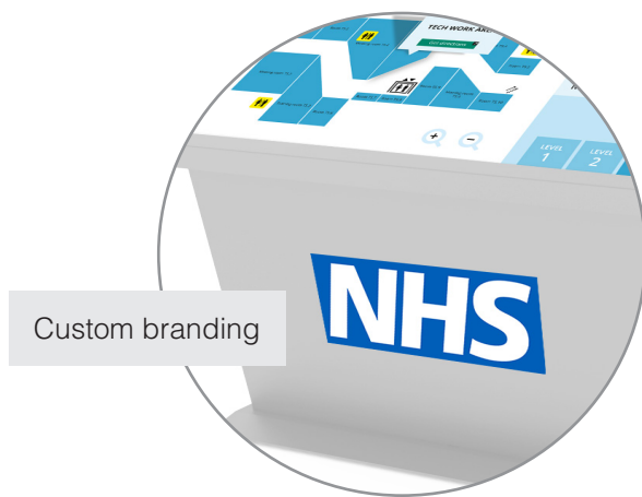
Single Screen (Landscape)