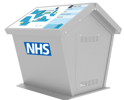
Dual Screen (Landscape)