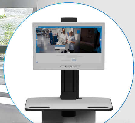
Compact AIO PC