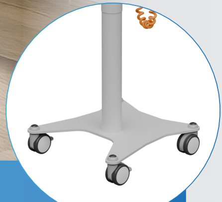
Small footprint for Space-Critical Clinical Environments