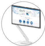
Articulated monitor arm