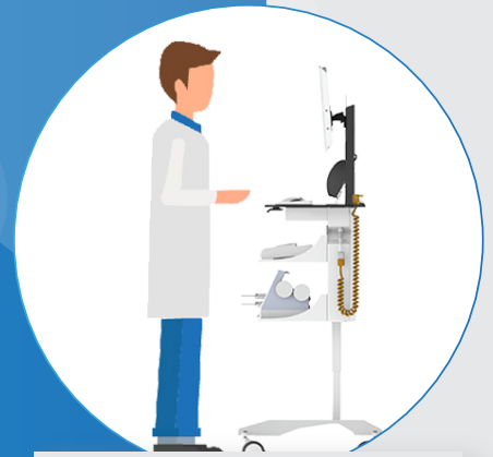
Electrically height adjustable to suit all users