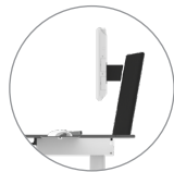
Adjustable monitor arm