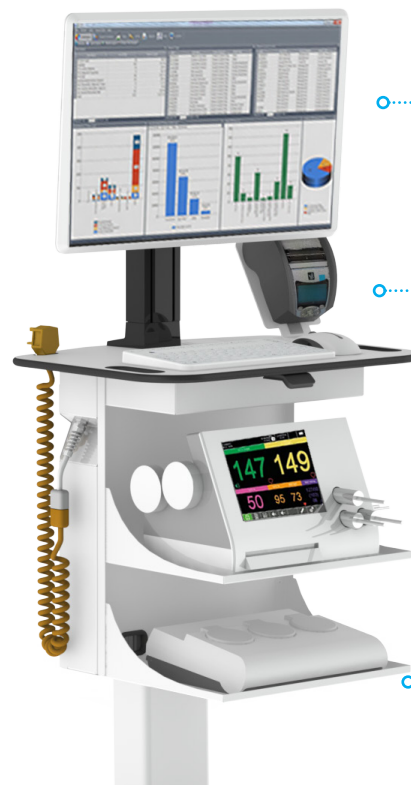
AIO Medical Grade PC

Enables clinicians to bring both monitoring and documentation directly to the patient, supporting person-centred care, eliminating duplicate documentation and paper systems and enabling efficient bedside care with minimal equipment.