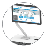
Articulated monitor arm