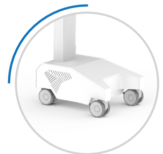
Integrated on-board battery

Can be adapted to suit your specific PC model