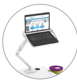
Laptop arm + bracket