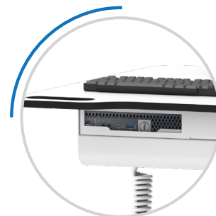
Custom PC aperture

Can be adapted to suit your specific PC model